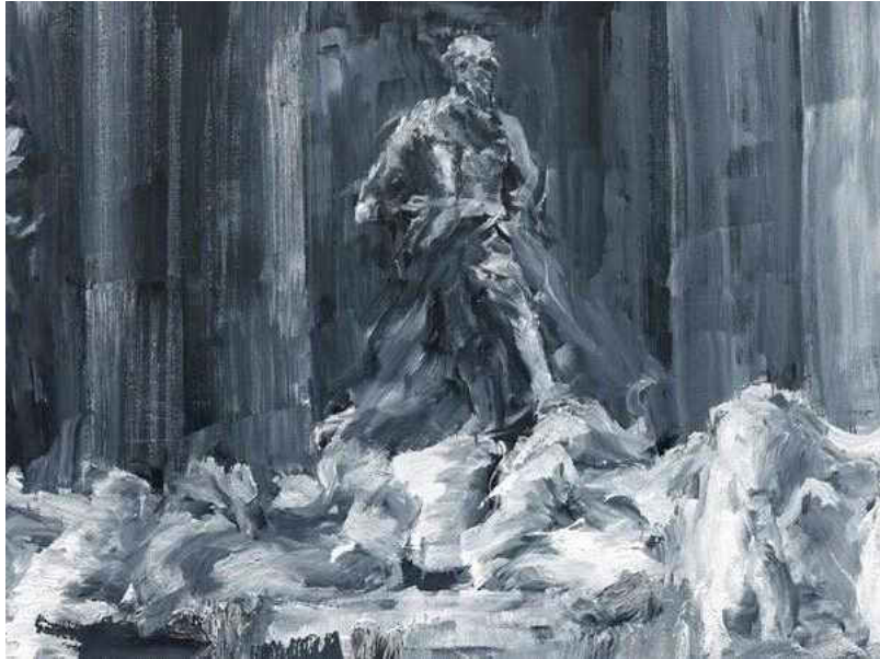
Fontaine de Trevi , (2015).

The artist – a fellow of the French Academy in Rome who lived in the Italian capital from 1993-1994 – presents his vision of the city and its fascinating history. Featuring the landscapes of Roman ruins, such as Fontaine de Trevi (2015), portraits of popes and iconic films with key moments of Italian political life, the paintings are a testament to artist's desires to expand his palette from bi-colour. The exhibition highlights the relationship between the French Academy in Rome, which is currently celebrating its 350th anniversary, and its host city.