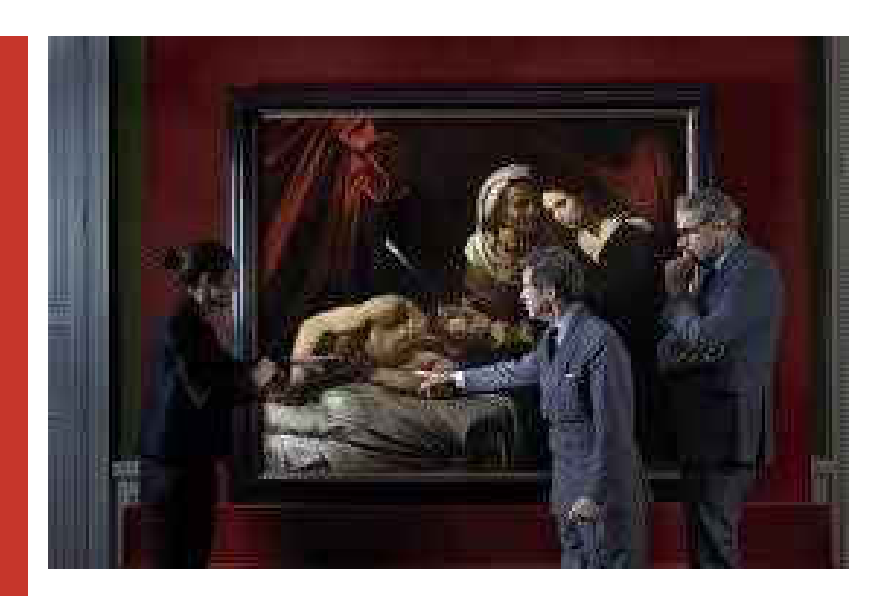
The Caravaggio during his public exhibition