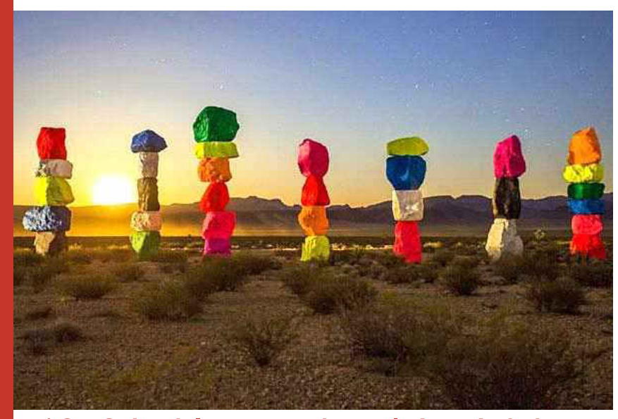
1858 Ltd International Art Advisory LONDON | PARIS | NEW YORK | DÜSSELDORF | SYDNEY | HONG KONG www.1858ltd.com