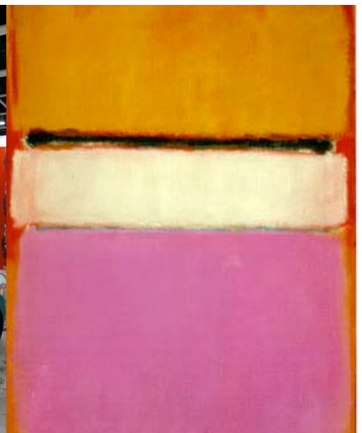
Top Image: A section from the 18th Century Qianlong era silk scroll, circa. 1748; Middle Image: China-Car , Ma Jun at the Hong Kong International Art Fair 2010 Right Image: White Center , Mark Rothko, courtesy of www.sothebys.com ;